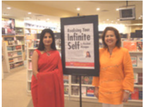
Public forum at MPH Book store, Malaysia