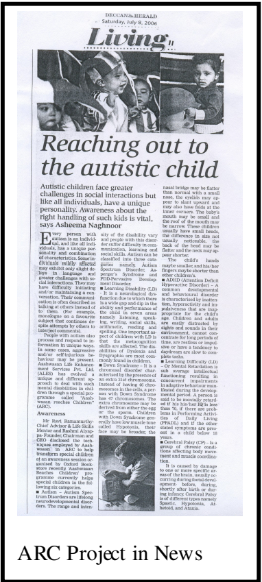
ARC Project in News