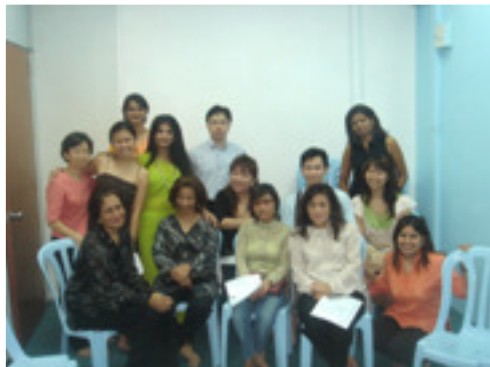
Client gathering in Aashwasan Office-Malaysia