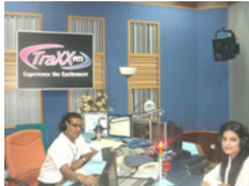
Program by Rashmi on Traxx FM Radio Channel, Malaysia