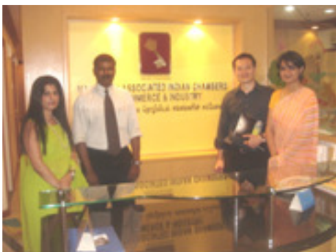
Meeting with the Malaysia Associated Indian Chamber of commerce & Industries